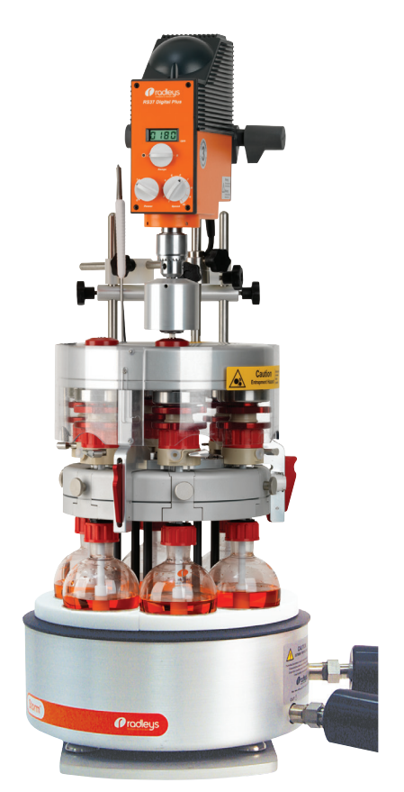
Storm with Carousel 6 Plus, Tornado, overhead stirrer and PTFE insulating plate