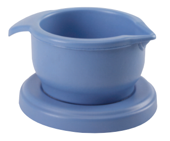
Small Cool-It bowl for flasks up to 400ml

The safest and most efficient way of cooling and stirring round bottom flasks to -78°C.