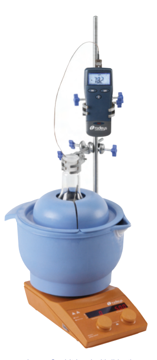
Large Cool-It bowl with lid, stirrer, stand and digital thermometer