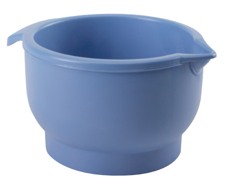
Large Cool-It bowl for flasks up to 2 litres