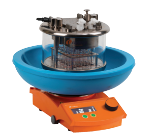
Optional HDPE cooling reservoir for chilled reactions to -78°C using dry ice and acetone

Designed for the synthesis of small compound libraries and drug discovery